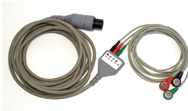
Figure HH-8-S1: The C-AAMI-504 ECG cable with three lead wires attached.