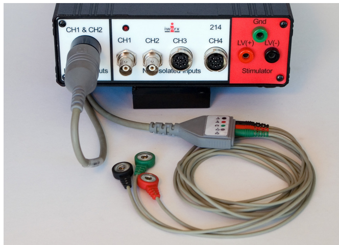
Figure HH-8-S3: The ECG cable and pulse transducer connected to an IWX/214. Plug the HSM-300 into Channel 3.